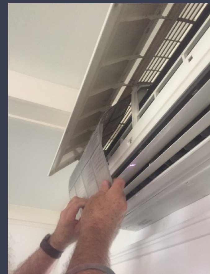
Remove filters by sliding them out.