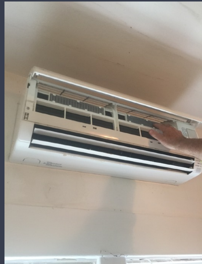
Secondary Units: Remove felt filters after removing filter slides