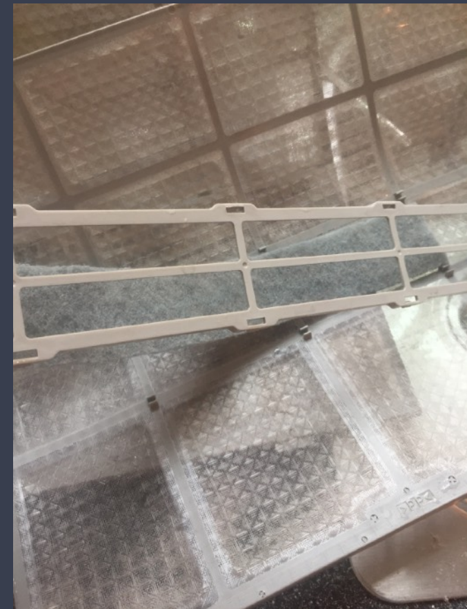
Main Unit: Felt is freed from frame contained within filter slides.