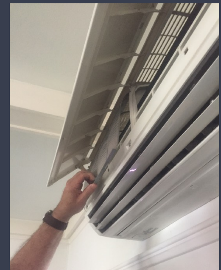
Dry felts and slides, and replace them. You are done! Thank You!!!