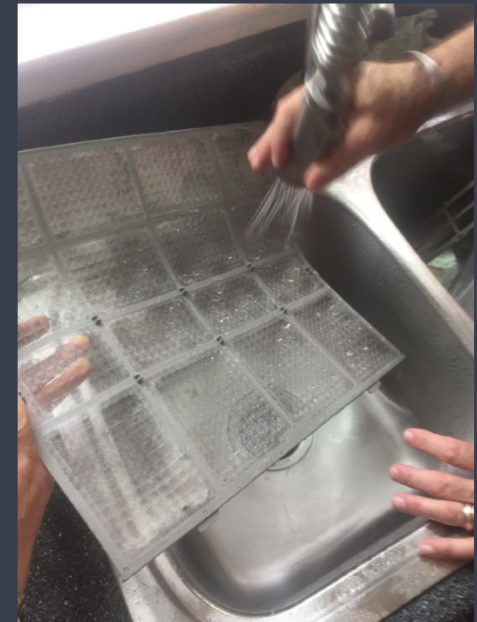
Remove dust and dirt with water. Kitchen sprayer works well