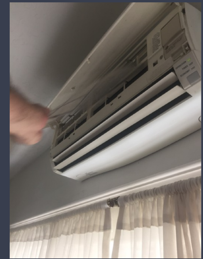
There are two filter slides on each unit.